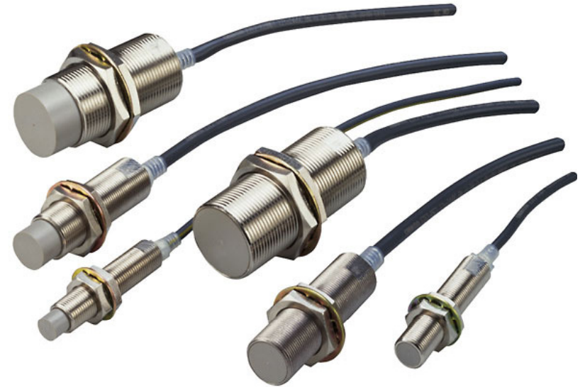
Pictures for illustration only. Design and specifications subject to change without prior notice