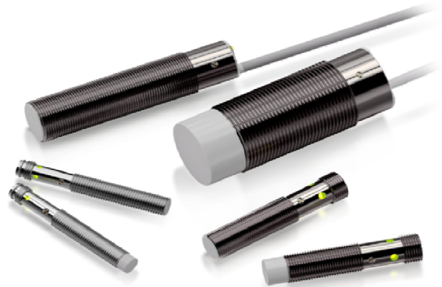
Pictures for illustration only. Design and specifications subject to change without prior notice